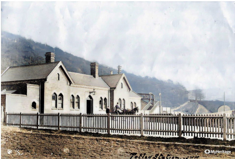
Station in 1872